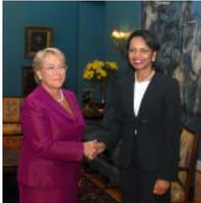
President Michelle Bachelet greets U.S. Secretary of State Condoleezza Rice.