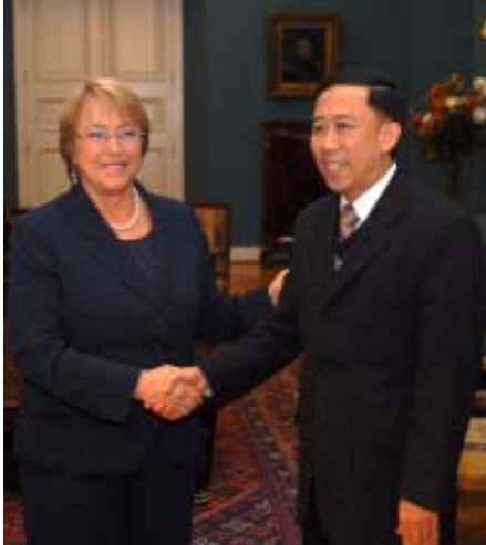
President Michelle Bachelet met with Thailand's Deputy Prime Minister and Minister of Commerce, Mingkwan Sangsuwan.